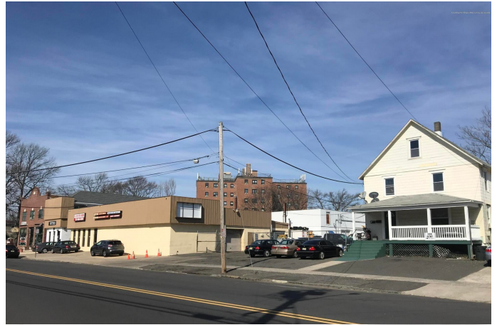
Google Maps 1011 Asbury Ave

Welcome investors! Near 40,000 square feet at the Gateway to Asbury Park's Asbury Avenue. The property presently has tenants operating their businesses who will probably stay as long as you want while you plan your development ideas.